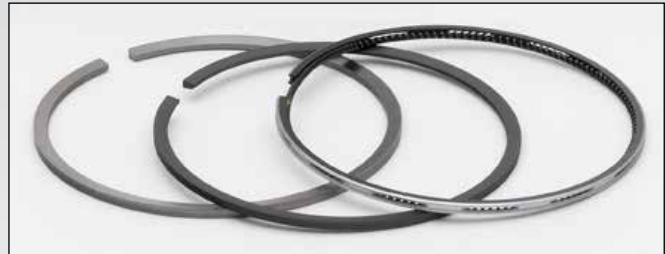
RSC18E Ring Set - Piston RSC18E1 Ring Set - Piston

Piston Ring Sets are now available for popular C18 engine applications. These new rings incorporate the latest in piston ring design technology. The fire ring features stainless steel construction with advanced PVD plating on the wear face and Gas Nitriding on the side face for superior ring wear characteristics. The steel oil control ring is hard chrome plated on both the ID and OD surfaces for durability. Contact Interstate-McBee for exact applications.