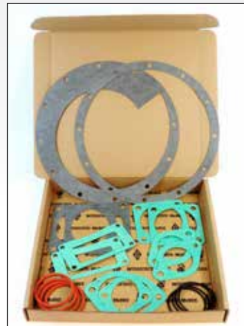
Gasket Set - Water Pump Mounting

Interstate-McBee is now producing gasket and seal kits for popular Waukesha® VHP® applications at the Cleveland manufacturing facility. These new sets contain the gaskets and seals needed to complete the installation of the water pump assembly on engines with cluster thermostat cooling. The M-G-961-2 is used on 12 cylinder engines and the M-G-961-1 is for use with 3521 engines.