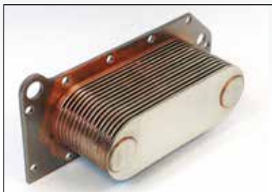
M-5284362 Oil Cooler Core 15 Plate – C8.3/ISC/ISL

Due to customer demand Interstate-McBee has added increased coverage for Cummins® engines. Contact Interstate-McBee for application and details.