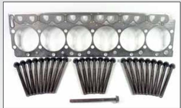
M-1889321C92 Gasket Set – Cylinder Head M-1889322C91 Kit – Head Gasket & Bolts

We are pleased to offer two new Gasket Sets to our ever growing gasket set product line. Both sets contain the latest style Head Gasket & produced in the USA cylinder head bolts. The cylinder head bolts M-1883133C1 are one time usage items and therefore new bolts are required each time a cylinder head is removed. Look to Interstate-McBee for the most current coverage of this very popular truck engine.