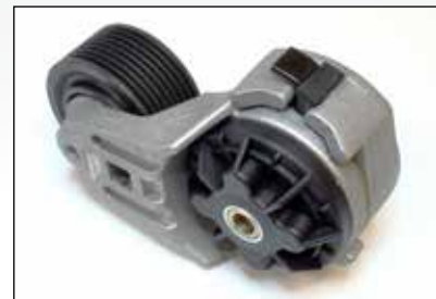
M-3976831 Belt Tensioner – QSB

All original names, numbers, symbols and descriptions are used for reference purposes only and do not imply that any part listed is the product of this manufacturer.