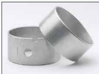
M-2255965 Sleeve – Bushing – Camshaft M-2255966 Sleeve – Bushing – Camshaft

New replacement Camshaft Bushings are now in stock for Caterpillar® C27/C32 engine applications. Contact Interstate-McBee for exact applications.