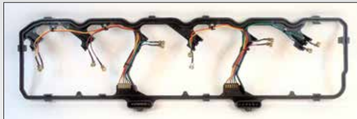
M-5264950 Valve Cover Gasket – Integrated Wiring

This component is a combination of a valve cover isolator seal and integrated wiring harness. The part number services both 5.9L & 6.7L midrange automotive models which were produced with valve cover type crankcase breather systems. This style dates from model year 2007 to present production.