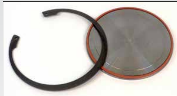
A-23538693 Water Pump Rear Cover Replacement Kit

The A-23538693 Water Pump Rear Cover Replacement Kit is designed to address Series 60® Water Pumps that have started leaking from the non-metallic rear cover area. The kit contains a new steel cover plate for added durability, o-ring seal and chamfered snap ring. This replacement can be performed on a Water Pump which is still installed on the engine, saving you and your customer valuable time and money.