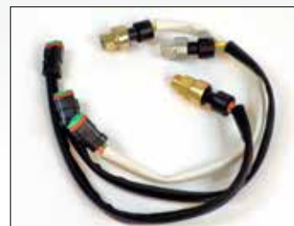
M-1946722 Sensor Group – Pressure M-1946724 Sensor Group – Pressure M-1946725 Sensor Group – Pressure

Three new Pressure Sensors are available for Caterpillar® engine applications. These new sensors are found in many on and off highway engine applications. Contact Interstate-McBee for details.