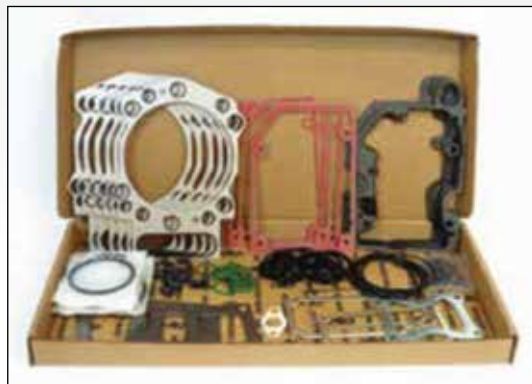
M-4955222 Gasket Set – Upper Engine

Interstate-McBee expands our Cummins® gasket program with the Upper Gasket Set listed below. This new addition increases our coverage of QSK19 engine models up to current production. The M-4955222 Upper Gasket Set includes the latest style metal core Rocker Cover Gasket (M-4917451), as well as the Seal Rings for the Common Rail Injection Adaptors.