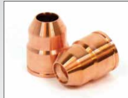
MCB7141 Injector Sleeve

The new MCB7141 is used with the M-3678536 Seal Ring, which is sold separately.