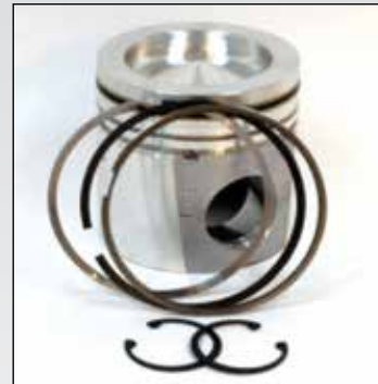
M-4309095 Piston Kit

We are pleased to announce the release of the M-4309095 Piston Kit . This kit includes the latest progression piston body, which features the newest ring groove design. In addition to this Piston Kit, Interstate-McBee announces corresponding Engines Kits for the convenience and value our customers expect.