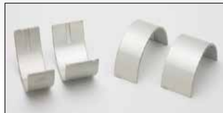
M-2323226 Bearing - Connecting Rod

Contact our Parts Professionals for exact applications.