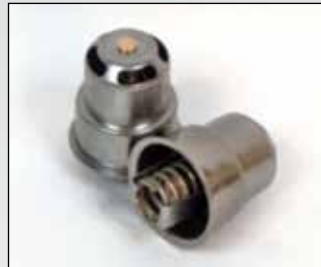
M-4952630 Thermostat – Oil Cooler