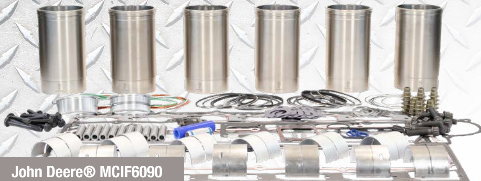
John Deere® MCIF6090