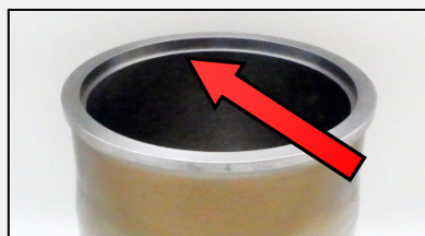
Scraper Ring placement

Interstate-McBee is proud to announce the release of our M-4376177* , M-4376178* , and M-4376179* In-Chassis Engine Kits featuring carbon scraper ring style cylinder liner kits. These kits allow rebuild opportunities for ISX15/QSX15 Tier 4 XPI, single cam MCRS models first produced in 2010.