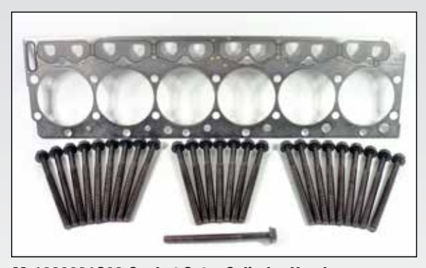
M-1889321C92 Gasket Set - Cylinder Head M-1889322C91 Kit - Head Gasket & Bolts

We are pleased to offer two new Gasket Sets to our ever growing gasket set product line. Both sets contain the latest style Head Gasket & produced in the USA cylinder head bolts. The cylinder head bolts M-1883133C1 are one time usage items and therefore new bolts are required each time a cylinder head is removed. Look to Interstate-McBee for the most current coverage of this very popular truck engine.