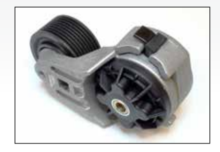
M-3976831 Belt Tensioner - QSB

All original names, numbers, symbols and descriptions are used for reference purposes only and do not imply that any part listed is the product of this manufacturer. Page 6 of 7 ® CUMMINS is a registered trademark of Cummins, Inc.