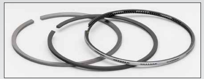
RSC18E Ring Set - Piston RSC18E1 Ring Set - Piston

Piston Ring Sets are now available for popular C18 engine applications. These new rings incorporate the latest in piston ring design technology. The fire ring features stainless steel construction with advanced PVD plating on the wear face and Gas Nitriding on the side face for superior ring wear characteristics. The steel oil control ring is hard chrome plated on both the ID and OD surfaces for durability. Contact Interstate-McBee for exact applications.