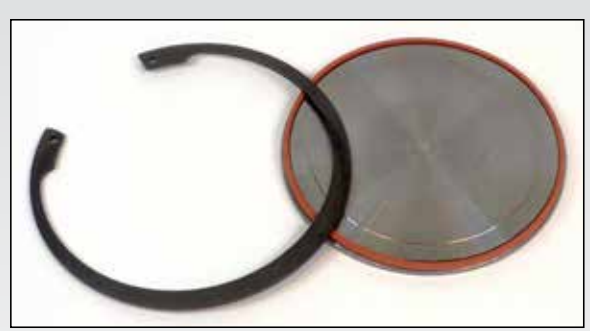
A-23538693 Water Pump Rear Cover Replacement Kit

The A-23538693 Water Pump Rear Cover Replacement Kit is designed to address Series 60<sup>®</sup> Water Pumps that have started leaking from the non-metallic rear cover area. The kit contains a new steel cover plate for added durability, o-ring seal and chamfered snap ring. This replacement can be performed on a Water Pump which is still installed on the engine, saving you and your customer valuable time and money.