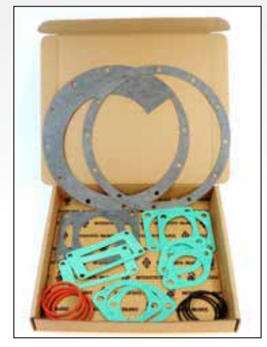
Gasket Set - Water Pump Mounting

Interstate-McBee is now producing gasket and seal kits for popular Waukesha® VHP® applications at the Cleveland manufacturing facility. These new sets contain the gaskets and seals needed to complete the installation of the water pump assembly on engines with cluster thermostat cooling. The M-G-961-2 is used on 12 cylinder engines and the M-G-961-1 is for use with 3521 engines.