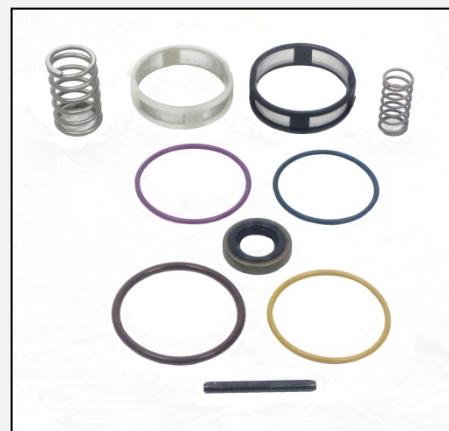
M-4025063-OHS – Kit – Injector Rebuild

Now available from Interstate-McBee our new expanded service kit for rebuilding the Cummins® ISX – HPI injector. This new kit, part number M-4025063-OHS , includes everything from our current M-4025063-OH kit with the addition of the two internal springs. These springs are critical to the optimal performance of the ISX injector, and we recommend replacing these each time the injector is rebuilt. New springs will help deliver correct injector timing and output and carry our 1 year, unlimited miles warranty.