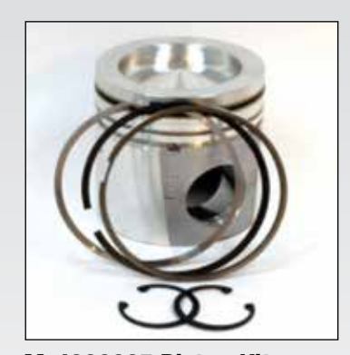
M-4309095 Piston Kit