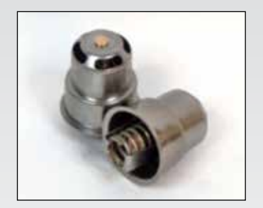
M-4952630 Thermostat - Oil Cooler