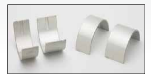
M-2323226 Bearing - Connecting Rod

Contact our Parts Professionals for exact applications.