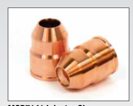
MCB7141 Injector Sleeve

The new MCB7141 is used with the M-3678536 Seal Ring, which is sold separately.