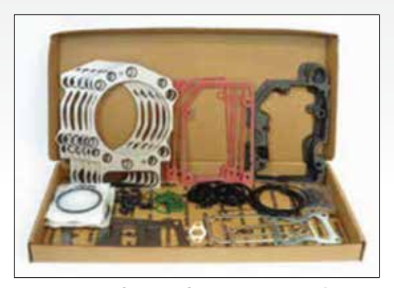
M-4955222 Gasket Set – Upper Engine

Interstate-McBee expands our Cummins® gasket program with the Upper Gasket Set listed below. This new addition increases our coverage of QSK19 engine models up to current production. The M-4955222 Upper Gasket Set includes the latest style metal core Rocker Cover Gasket (M-4917451), as well as the Seal Rings for the Common Rail Injection Adaptors.