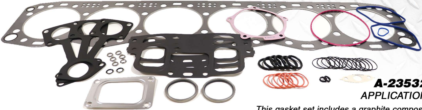
A-23532333 APPLICATION: S60

This kit includes a head gasket made of multi-layer steel (MLS) stainless steel for positive sealing and advanced polymer seals for water and oil passages to seal at high temperatures.