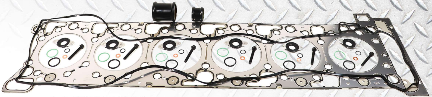
A-A4720161920 APPLICATION: DD15

This kit includes a head gasket made of multi-layer steel (MLS) stainless steel for positive sealing and advanced polymer seals for water and oil passages to seal at high temperatures.