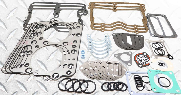
M-4024945 APPLICATIONS: NT 855

Made from only the highest quality materials, this gasket set contains the latest designed head gasket for improved sealing ability.