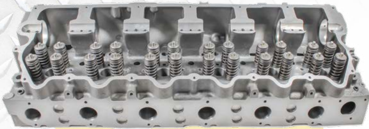
MCB2239250AINC Cylinder Head Assembly

CAT®/CUMMINS®/DETROIT DIESEL® ENGINE APPLICATIONS