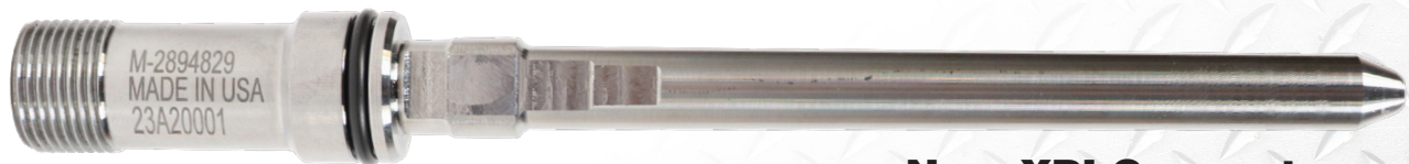
New XPI Connector

Cummins® is a registered trademark of Cummins, Inc.