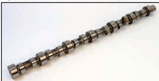
M-3966430 Camshaft – ISL8.9 & QSC8.3

Due to customer demand, Interstate-McBee has added increased coverage for the popular Cummins® Midrange and ISL/QSC engines. Contact Interstate-McBee for application and details.