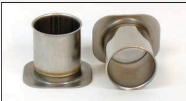
M-1948124 - Exhaust Port Sleeve