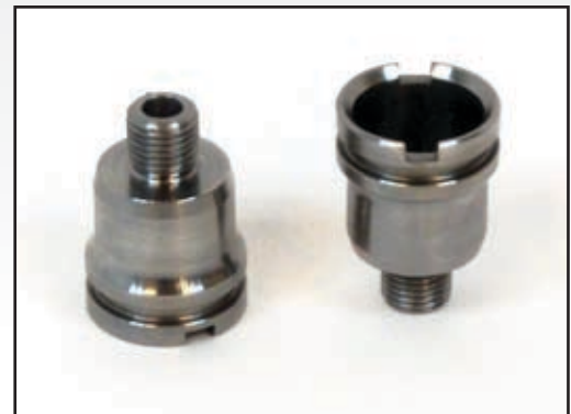
A-23538840 Injector Tube - Stainless Steel

The A-23538840 is a new Injector Tube and is a direct update from the previous A-23533148 part number. This stainless steel Injector Tube is for use on engines which utilize N3 injectors. You will need to order one M-23533147 Tube Seal for each tube replaced to ensure proper fit and seal.