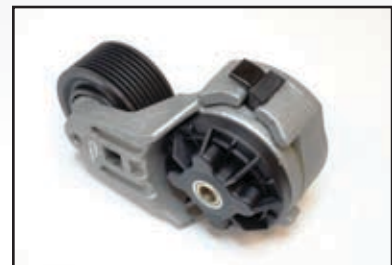
M-3937555 Belt Tensioner Assembly B & C Series

All original names, numbers, symbols and descriptions are used for reference purposes only and do not imply that any part listed is the product of this manufacturer.