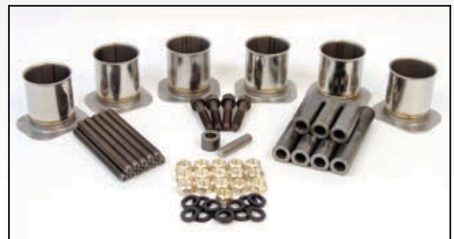
MCB3406CHKT - Exhaust Hardware Kit

All original names, numbers, symbols and descriptions are used for reference purposes only and do not imply that any part listed is the product of this manufacturer.